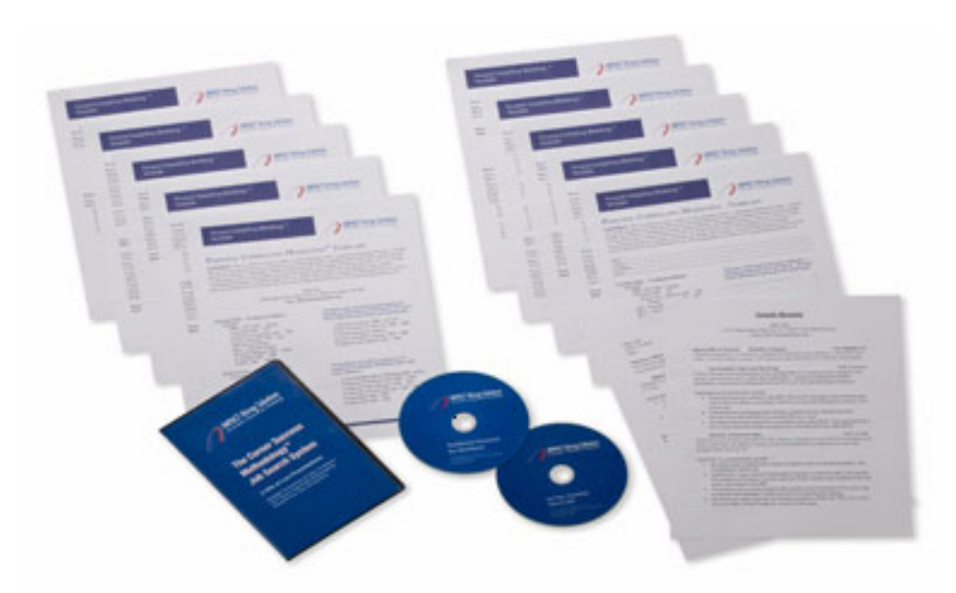
The Complete Resume System